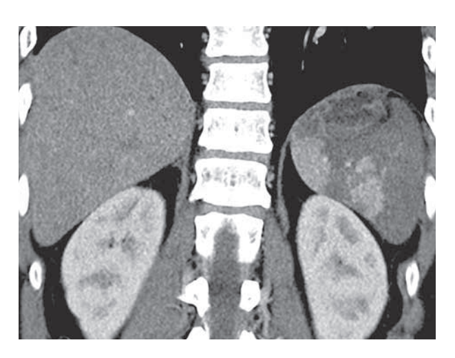
Fig. 1. — Computer tomography of the spleen revealed multiple wedge-shaped areas of decreased attenuation compatible with splenic infarcts.